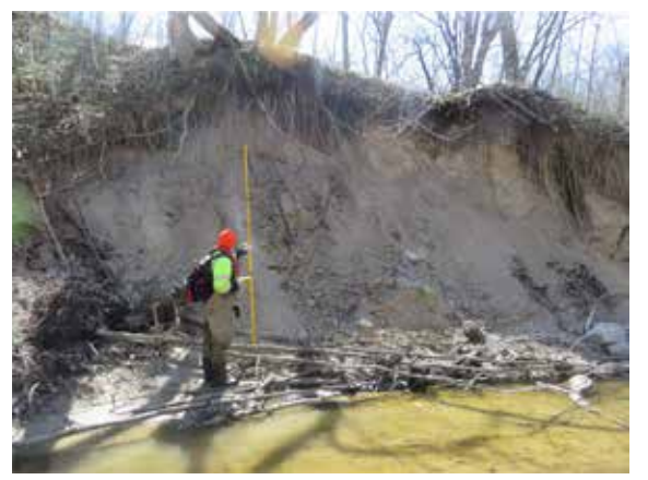
Measuring severe bank erosion along Bluff Creek

The District seeks to address these and other erosion challenges through its water quality strategies described in Section 3.2.6.2.