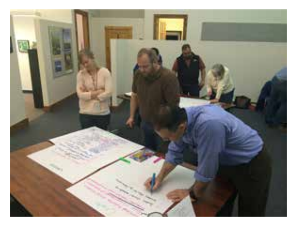
TAC members identifying concerns related to creeks in RPBCWD.

The Freshwater Society facilitated the workshops. Each meeting was conducted in the same format: