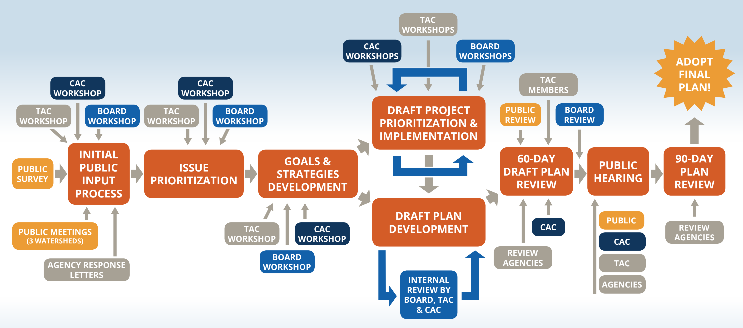
FIGURE 2-2 STAKEHOLDER INVOLVEMENT DURING RPBCWD PLAN DEVELOPMENT