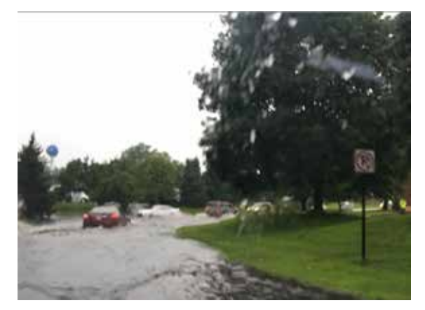
Street flooding in the District during an August 2016 rainfall event