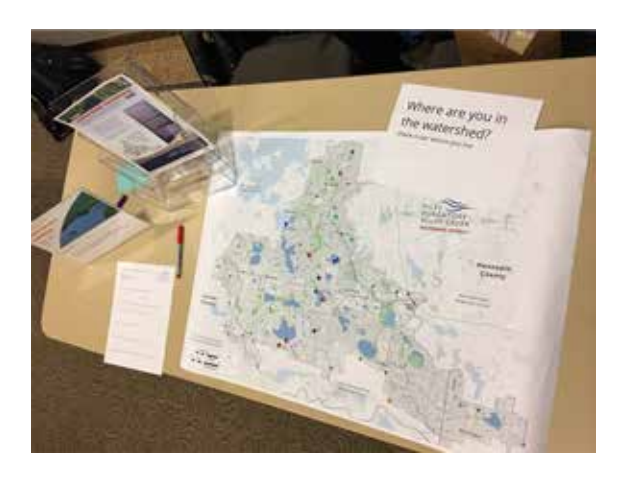
Watershed outreach map showing where participants came from.

District staff also identified subtopics such as invasive species, pollution, water quality trends and resource access. The most frequent subtopic was metrics, which was defined as the way water quality or project successes are measured.