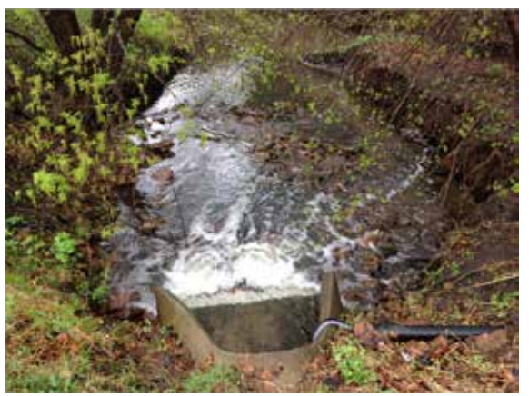
Stormwater discharging from Lake Susan Park Pond into Riley Creek

The District seeks to address these and other pollution challenges through its water quality strategies described in Section 3.2.6.2.