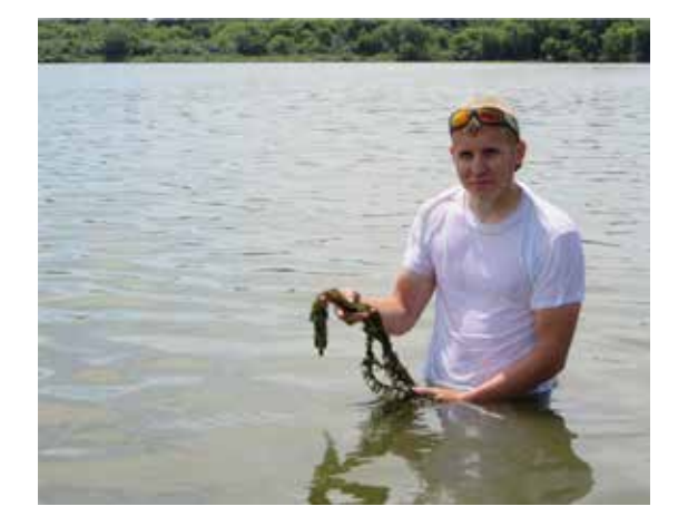
Rapid AIS response by hand-pulling watermilfoil from Staring Lake

The District seeks to address these and other