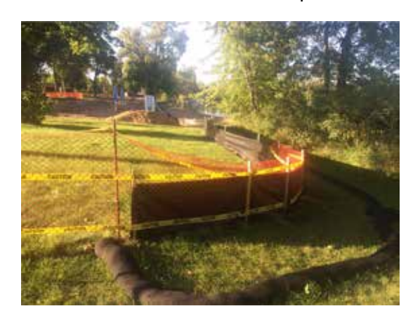
Temporary and permanent erosion control measures are essential to reducing pollution in runoff

first adopted in 1973 and last revised in 2014, to ensure that land-disturbing activities do not degrade water quality, increase risk of flooding, or otherwise negatively affect water resources. Consistent enforcement and periodic evaluation of District rules is critical to protect valuable resources while not placing unnecessary burdens on developers, residents, and cities.