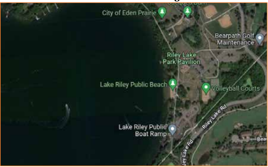
Figure 1 – Lake Riley Public Boat Launch, Eden Prairie, MN