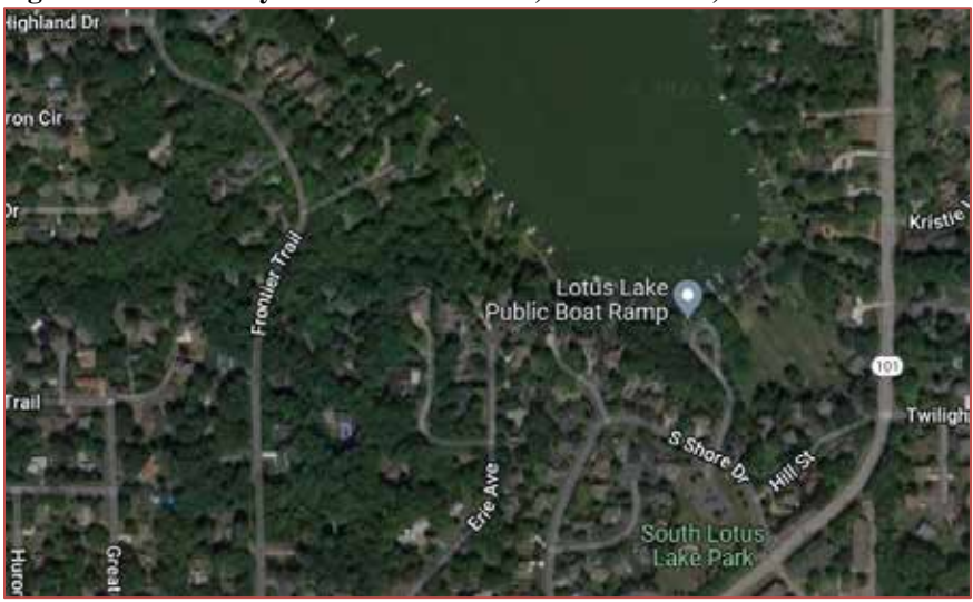
Figure 2 – Lotus Lake Public Boat Launch, Chanhassen, MN

Figure 1 – Lake Riley Public Boat Launch, Eden Prairie, MN