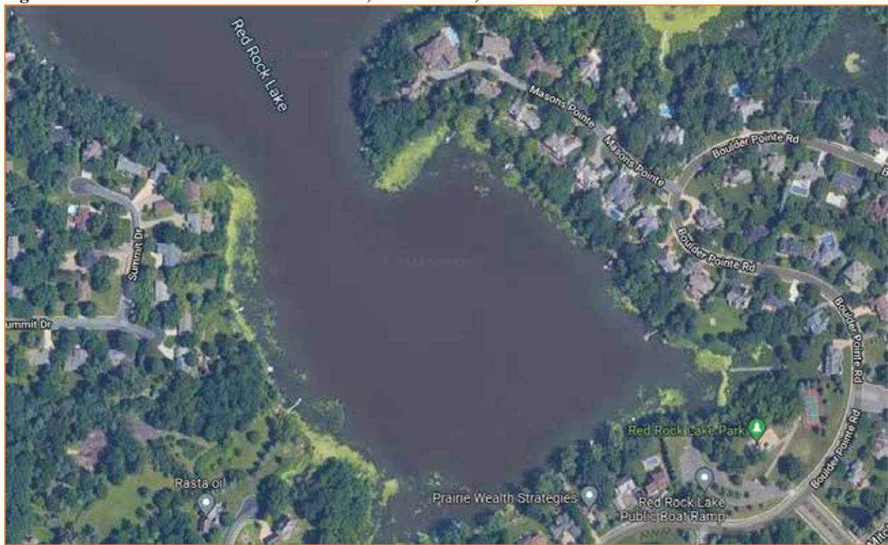
Figure 5 – Red Rock Lake Public Boat Launch, Eden Prairie, MN