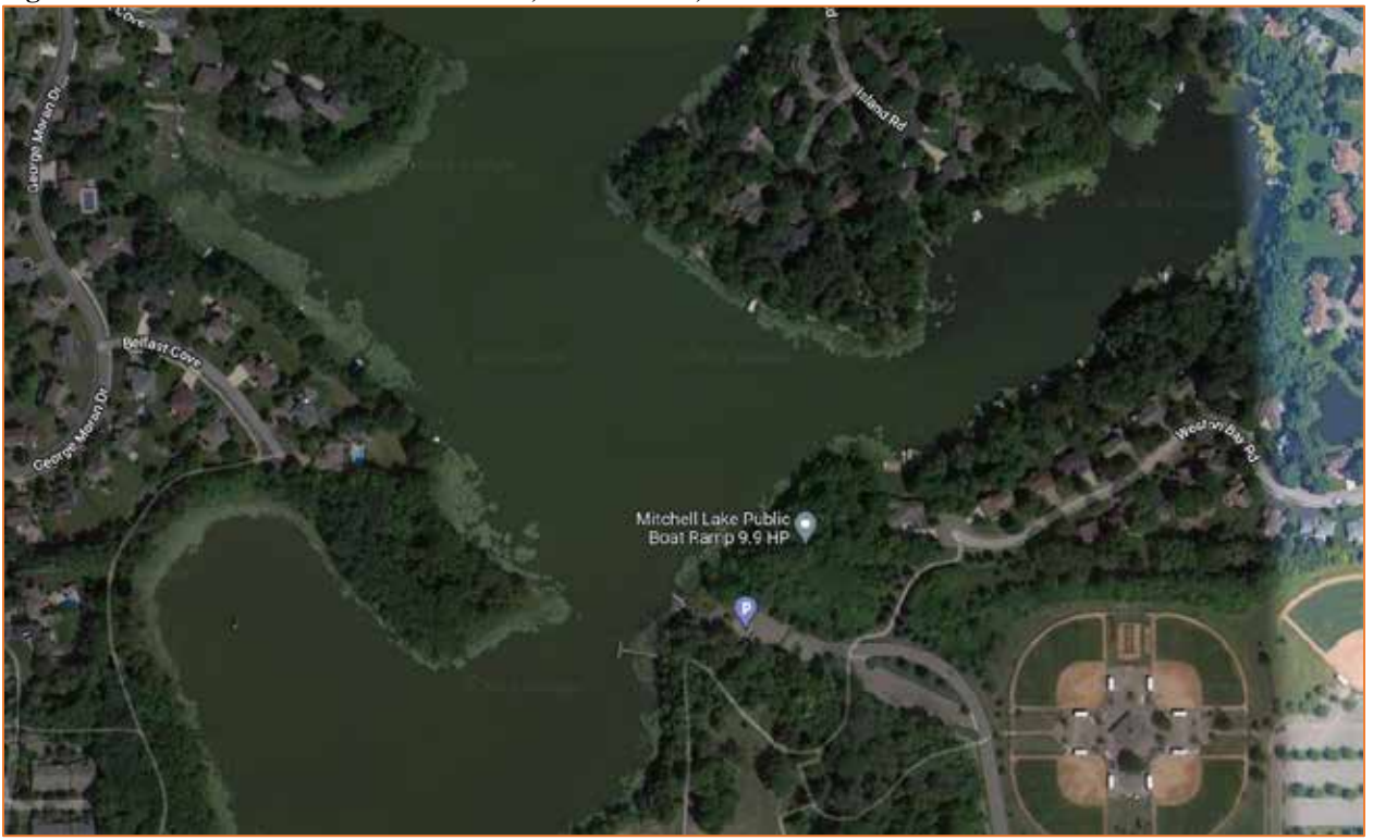
Figure 4 – Mitchell Lake Public Boat Launch, Eden Praire, MN