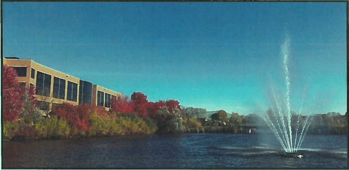
Purgatory Creek at Southwest Station