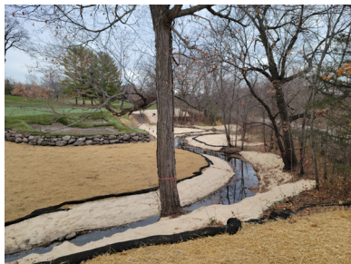
Re-meandering and bank stabilization of Riley Creek within Bearpath Golf and Country Club in Nov '21.

In 2021, the channel was realigned, all stabilization practices such as riffles, root wads, and vegetated reinforced soil slope (VRSS) were installed, and the flood plain area has been temporarily stabilized. The spring of 2022 saw the remainder of the buffer areas planted into native vegetation. There is three years of on-going maintenance left to complete.