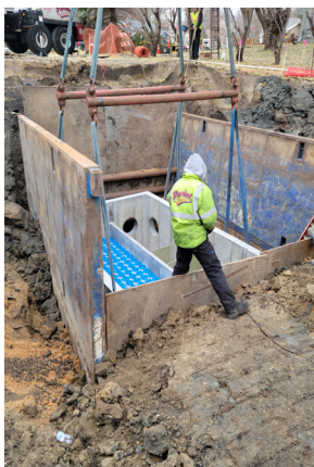
Kraken® filters were installed in Nov '21

The Use Attainability Assessment (UAA) undertaken by the District and the City of Chanhassen in 2016 found that the majority of pollutant loading to Rice Marsh Lake is due to runoff within the watershed (44%), with internal loading accounting for an additional 35%, and the remaining load from upstream water bodies or atmospheric deposition. The UAA concluded that Rice Marsh Lake Subwatershed RM-12A was the largest contributor to external pollutant loading to Rice Marsh Lake. In the fall of 2018, Rice Marsh Lake was treated with Aluminum Sulfate (alum) to treat the internal loading. The Rice Marsh Lake Water Quality Improvement Project was undertaken to address the external load from subwatershed RM-12A.